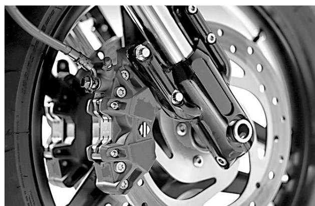
ROOTS Styling of the 2009 Harley-Davidson XR1200 is derived from the XR-750 dirt track racer. Racing influence is also seen in the simple instrumentation, above left. Four-piston Nissin calipers, above right, are used at the front.

know there is a brawny motor down there, but you can comfortably ride through a tank of gas, about 140 miles.