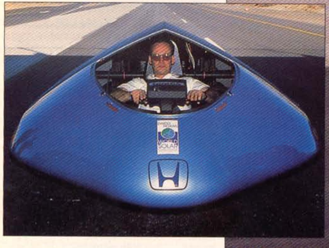
Tight fit: The driving position is reclining.